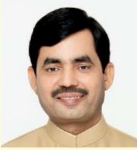
सैयद शाहनवाज़ हुसैन माननीय मंत्री उद्योग विभाग, बिहार सरकार