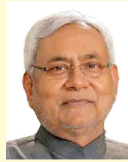
श्री नीतीश कुमार माननीय मुख्यमंत्री, बिहार